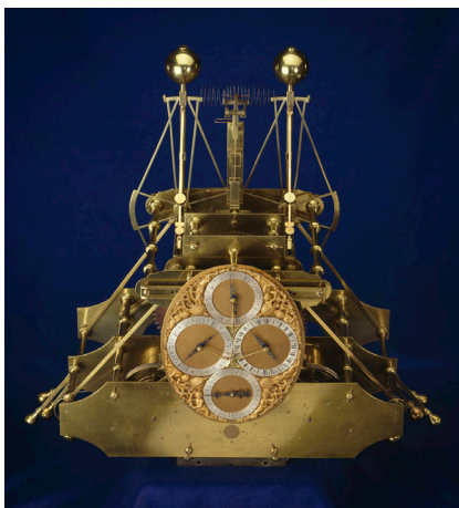
The H1 Marine chronometer, as developed by John Harrison

A invention by John Harrison in 1761, which followed for the precise calculation of longitude and consequentially the conversion of the planet into a geometrical grid.